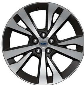
20" Bright Machined-Face Aluminum (Standard on Platinum)