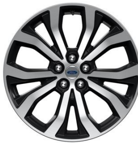
20" Machined Aluminum with Painted Pockets (Standard on ST)