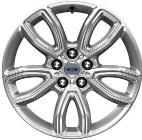
18" Painted Aluminum (Standard on Base)