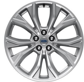
20" Premium Painted Aluminum (649) (Optional on XLT 202A. Standard on Limited 300A.)