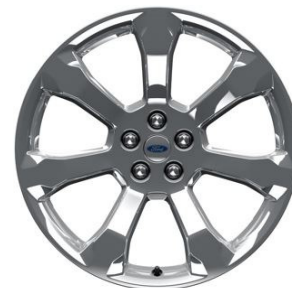
21" Premium Polished Aluminum (64Z) (Optional on Platinum)