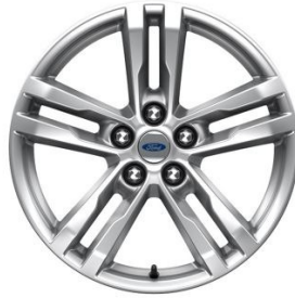
18" Five-Spoke Sparkle Silver-Painted Aluminum (Standard on XLT)