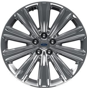
20" Hand Polished Aluminum (64U) (Standard on Limited Hybrid 310A. Optional on Limited 300A.)