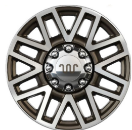
20" Bright Machined Cast Aluminum w/Light Caribou Painted Pockets; Light Caribou Wheel Ornament with King Ranch® Logo (Opt. on 4x4 F-250 and F-350 SRW King Ranch®) – 643