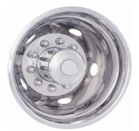
17" Stainless Steel Wheel Covers (Front & Rear) (Opt. on XL and XLT) – 945

19.5" Forged Polished Aluminum w/bright hub cover/center ornament (Included on STX Pkg. (17S) F-450) – 64D