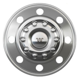
19.5" Forged Polished Aluminum w/bright hub cover/center ornament; Light Caribou wheel ornament with King Ranch® Logo – 64D

17" Forged Polished Aluminum w/bright hub cover/center ornament (Std. on King Ranch® F-350) – 64J