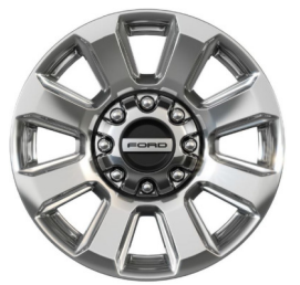
20 " Polished Aluminum (Std. on F-250 F-350 SRW Platinum) – 64U

20" Bright Machined Cast Aluminum w/Magnetic Painted Pockets and Bright Hub/Cover Center Ornament (Opt. on 4x4 F-250 and F-350 SRW Lariat) – 642