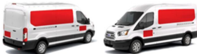
Decal #3 (51G): – Up to 45 sq-ft 1