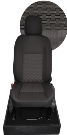
★Dark Palazzo Grey Cloth