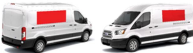
Decal #2 (51F): – Up to 25 sq-ft 1