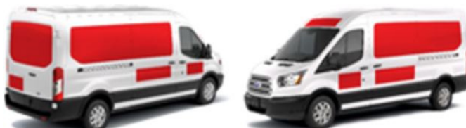
Decal #4 (51H): – Up to 70 sq-ft 1