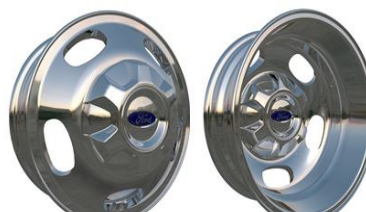
16" Heavy-Duty Forged Aluminum Wheel

(Standard on Heavy- Duty Front Axle configurations)