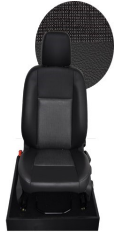
★Dark Palazzo Grey Vinyl