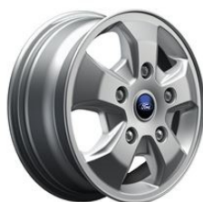
16" Styled Aluminum Wheel (64S)