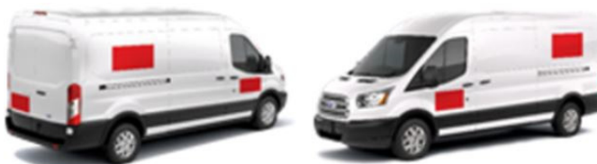
Decal #1 (51E): – Up to 15 sq-ft 1