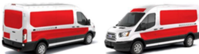
Decal #5 (51J): – Up to 95 sq-ft 1