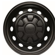
16" Matte Black Alloy Wheel (64G)