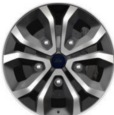
16" Black Aluminum Alloy Wheel (644)