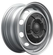
16" Silver Steel Wheel with Black Hubcap

(Standard on Standard Front Axle configurations)