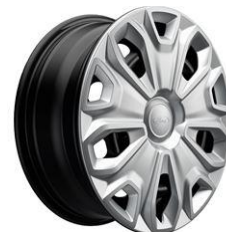
16" Steel Wheel with Full Silver Wheel Cover (64H)

(Standard on Heavy- Duty Front Axle configurations)