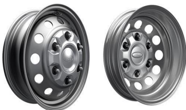
16" Heavy-Duty Silver Steel Wheel with Silver Hubcaps and Exposed Lug Nuts

(Standard on Standard Front Axle configurations) & (Standard on Heavy-Duty Front Axle configurations)