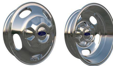
16" Heavy-Duty Forged Aluminum Wheel

(Standard on Standard Front Axle configurations) & (Standard on Heavy-Duty Front Axle configurations)