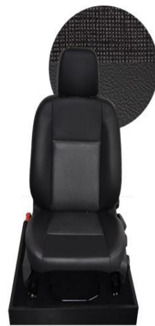
★Dark Palazzo Grey Vinyl