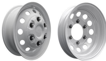
16" Heavy-Duty White Steel Wheel with Exposed Lug Nuts (76D – Fleet Only)