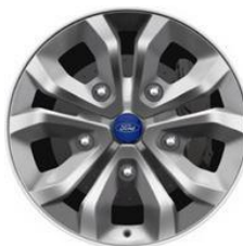
16" Silver Aluminum Alloy Wheel (647)