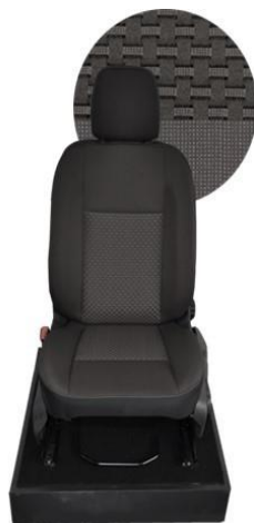
★Dark Palazzo Grey Cloth