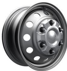
16" Silver Steel Wheel with Silver Hubcaps and Exposed Lug Nuts (641)

(Standard on Standard Front Axle configurations)